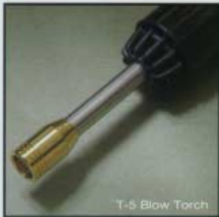
T-5 Blow Torch