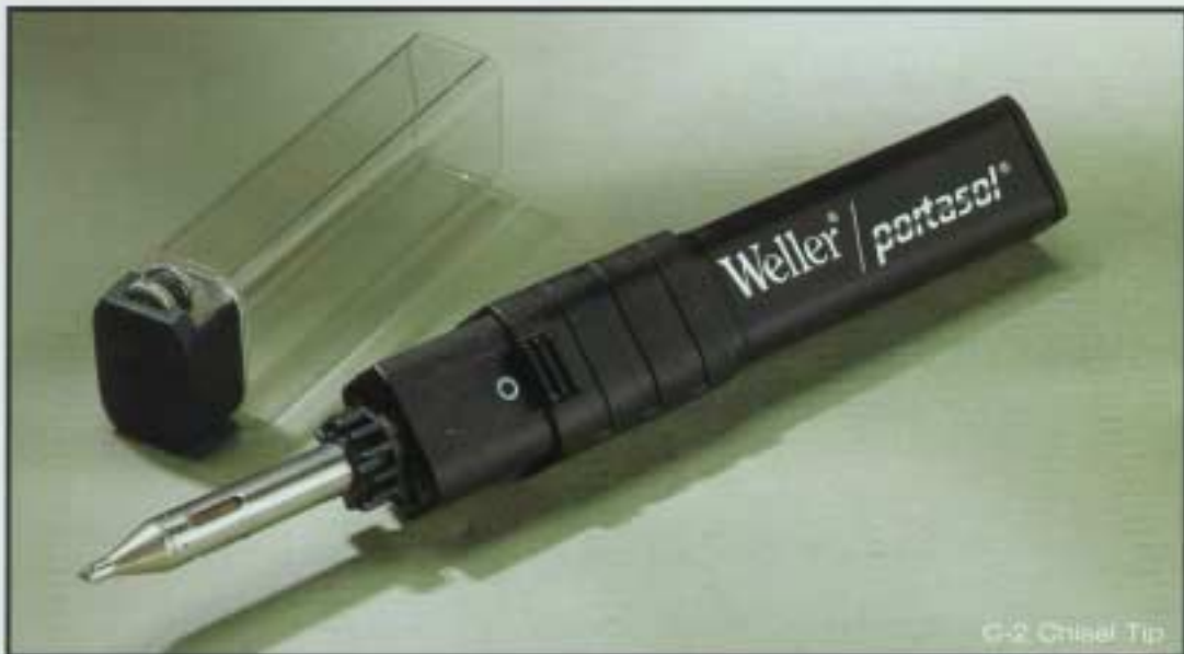
C-2 Chisel Tip