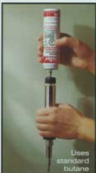
Uses standard butane