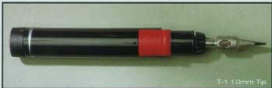
T-1 1.0mm Tip