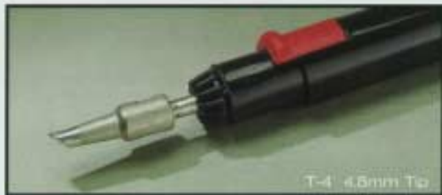
T-4 4.8mm Tip