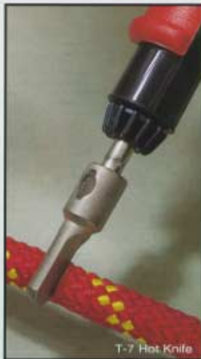
T-7 Hot Knife