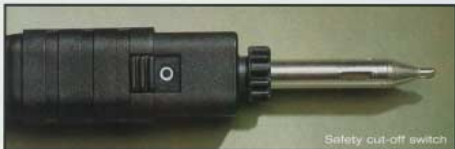
Safety cut-off switch

There are no cords, batteries, or cartridges, so the Portasol C1C goes anywhere. Accessories include 1/8" chisel tip and 1/8" needle soldering tips, as well as a hot knife tip.